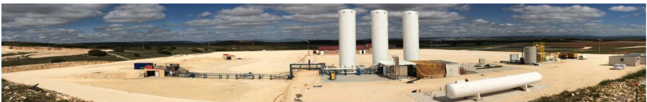
Hontomín Technology Development Plant, Northern Spain