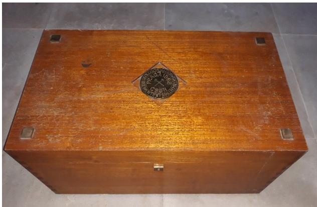
Memory Coffer with 23 rd IGC documents.