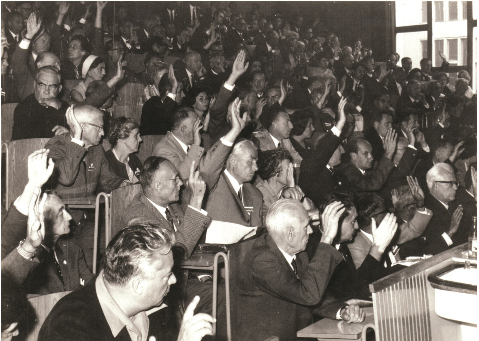
The Closing Ceremony: Participants of the final General Assembly on 23 rd August voting on the premature closing.