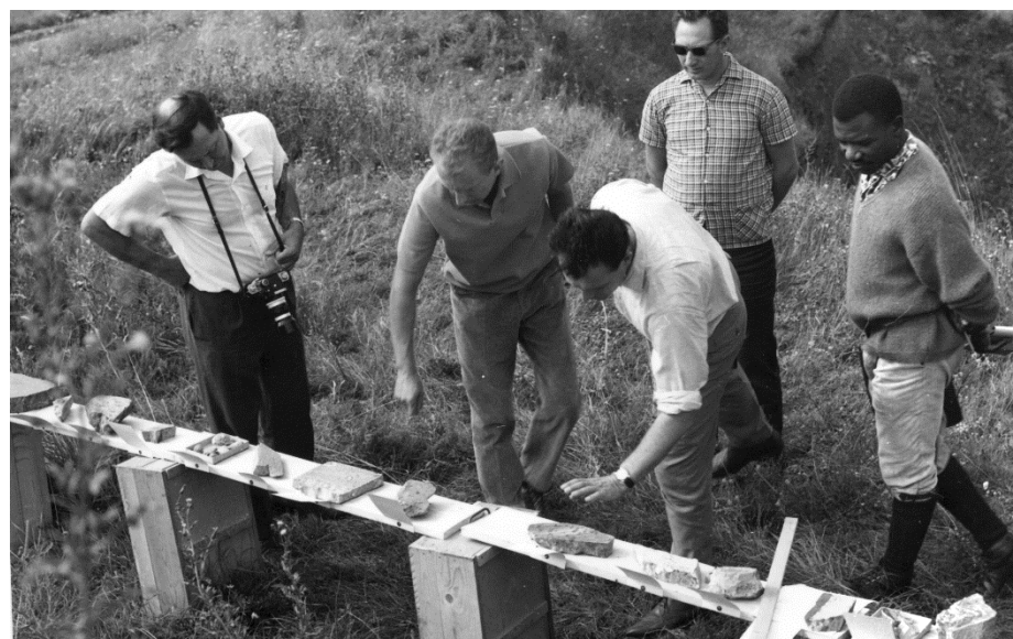
The Chvaletice mine pre-Congress excursion.